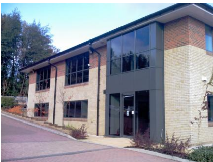
JBA Consulting: the Newport office

t: +44 (0)1633 415363 www.jbaconsulting.co.uk